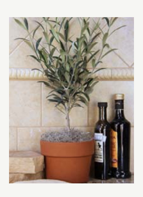
5" Clay Olive Tree