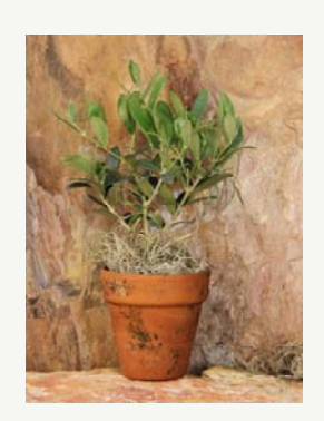
3" Clay Mini Olive Tree