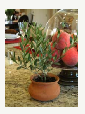
4" Clay Washpot Olive Tree