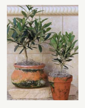
4" Clay Washpot and 3" Clay Mini Olive Trees

GROWING YOUR PLANT OUTDOORS: Your Olive Tree can be transplanted outside as long as you live in a location where the temperature does not fall below 10°F. Also, Olives prefer the soil to have a pH between 6.6 and 8.5 and be at least slightly calcareous. Transplant as you would any other tree and keep slightly moist until it is established. Once established, Olives are drought tolerant. Choose a spot in full sun; remember, though, that your Olive Tree was grown in a greenhouse and will get sunburned if placed in full sun upon receipt. Slowly acclimate your plant to full sun before transplanting it.