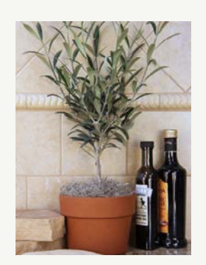
6 1/2" Clay Olive Tree