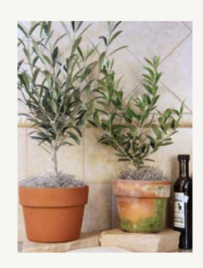
5" Clay and 6 1/2" Clay Olive Trees

Once established, Olive Trees are very tough and non-demanding trees. You may choose to continue to water and fertilize them or not; they will grow faster and softer if taken care of or will be slower and hardier if left to their own devices.